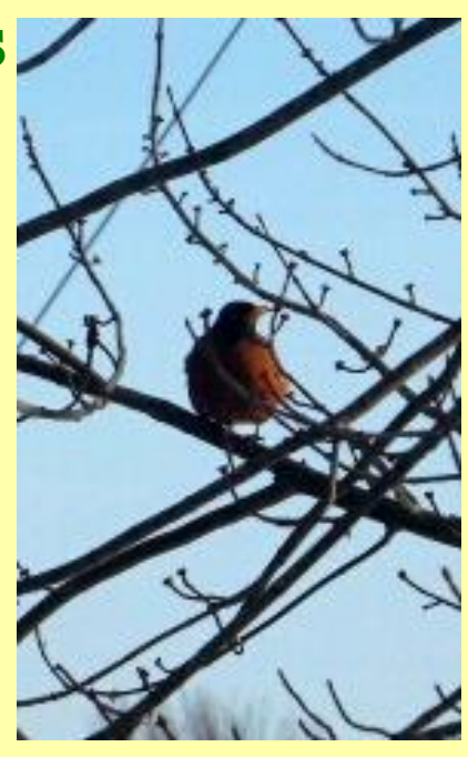
The Robins are back!